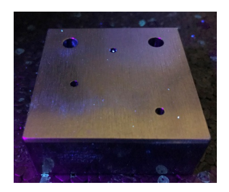
A specially cleaned part for oxygen applications under ultraviolet light.

1(EIGA DOC 33/18, Cleaning of Equipment for Oxygen Service; ASTM G93/G93M-19:2019, Standard Guide for Cleanliness Levels and Cleaning Methods for Materials and Equipment Used in Oxygen-Enriched Environments).