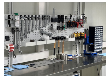
Maximators special area for cleaning and assembly of components with high cleanliness requirements