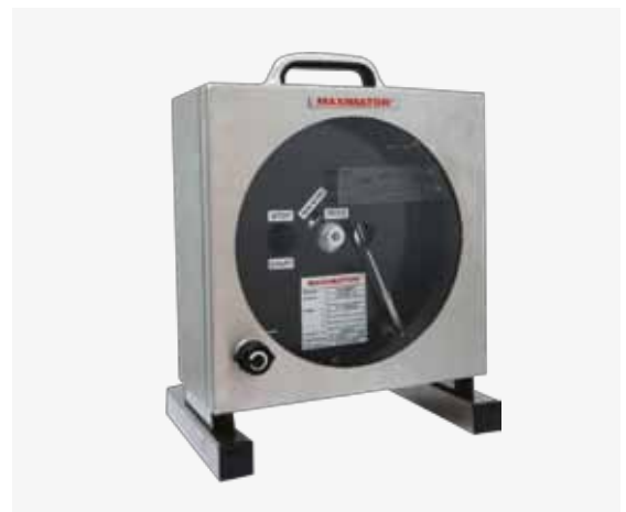
8" Portable Pressure Chart Recorder Maximator MX 4888SST